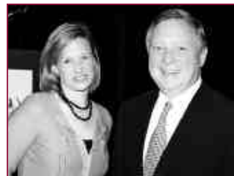
The evening featured remarks by Cornelia Grumman, Pulitzer-Prize winning member of the Chicago Tribune editorial board and U.S. Senator Dick Durbin.